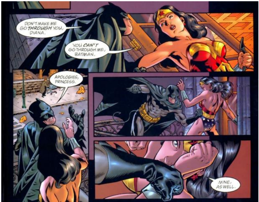
example of "Comic