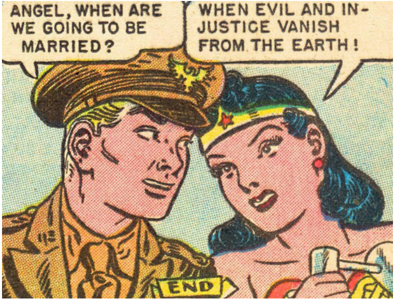
Example of comic book