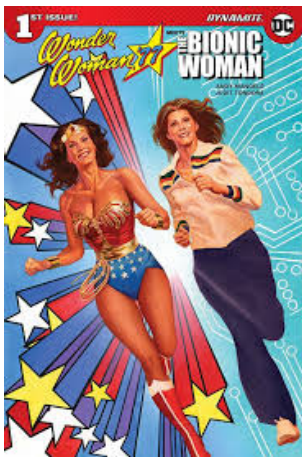
The stars here are great examples of how to utilize iconography, both Wonder Woman’s and comic book.