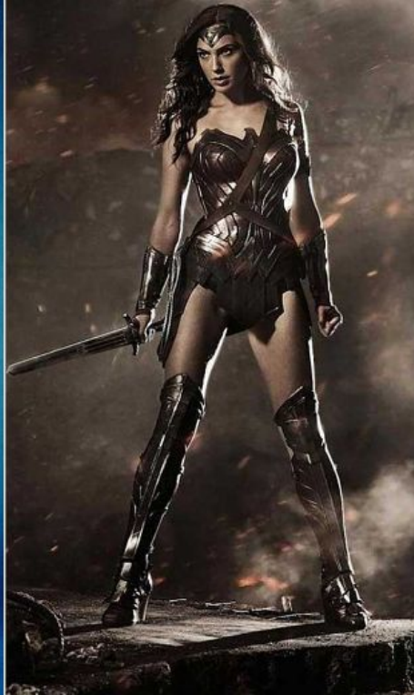
Lynda Carter vs.