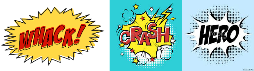
Example of Comic